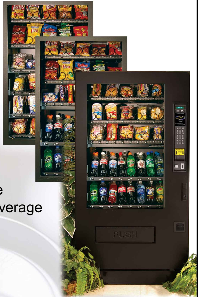
The 480 SnackCombo Refresh Ultimate Vision Series (Three different configurations shown)