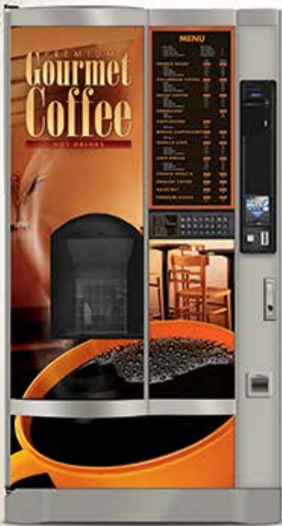
MODELS 673 FB, 675 FD, 677 FB w/Grinder