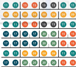
Merchant Media 4-Wide 38 Select Standard Model