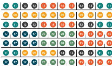
Merchant Media 6-Wide 58 Select Standard Model